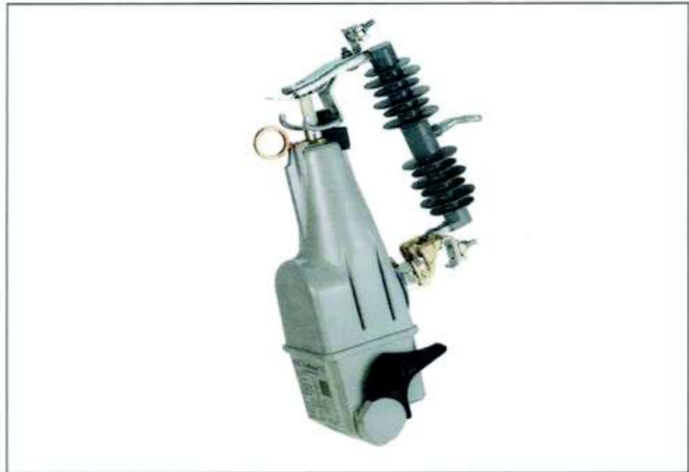
Figure 1: S&C TripSaver II Cutout-Mounted Recloser

The automatic circuit cutout-mounted reclosers shall have the form shown in FIG.1 below and shall be S&C TripSaver II Cutout-Mounted Recloser, Base Catalogue number 990232