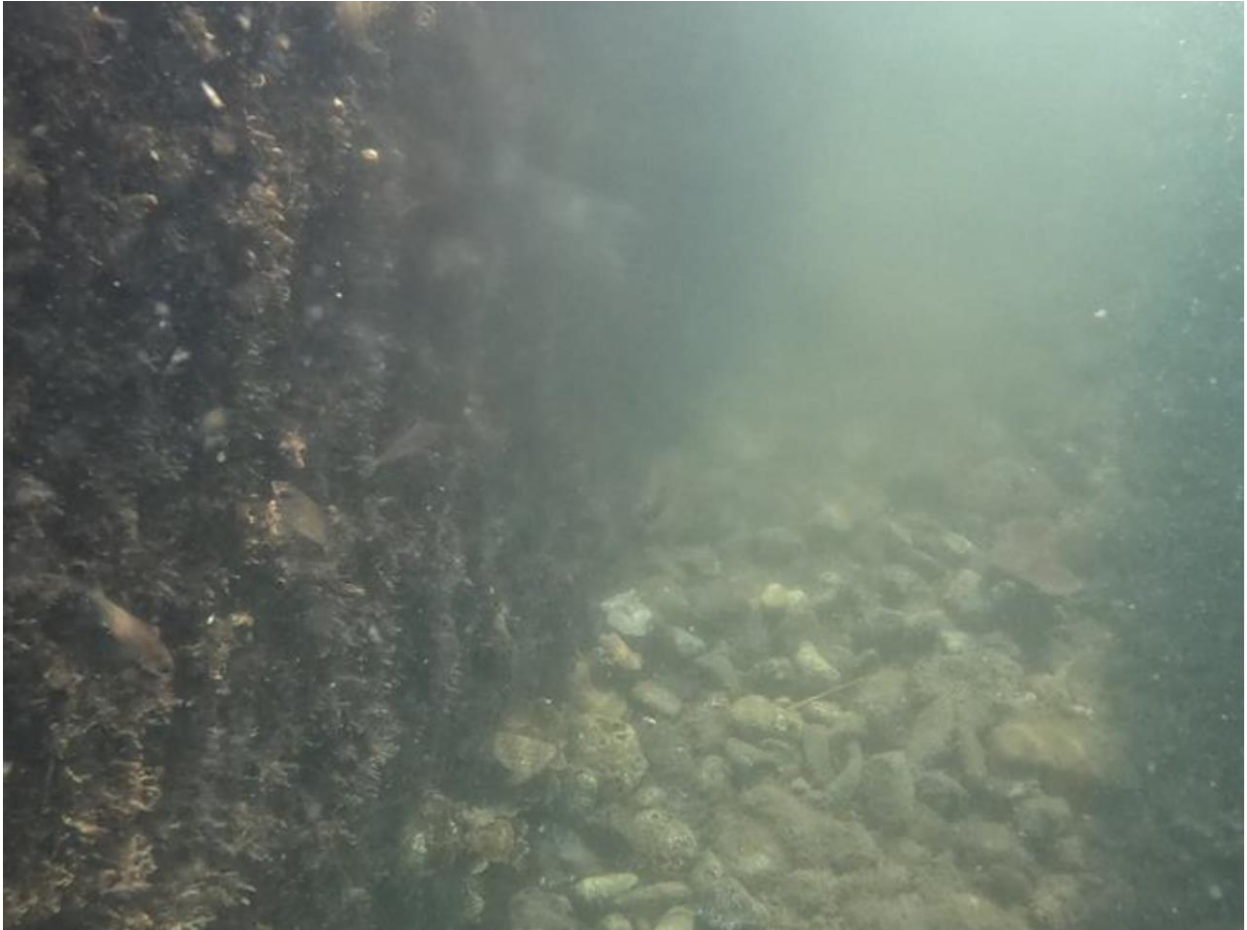
Plate 2 Macroalgae growing along the seawall (dredge basin harbour side) and rubble in the proposed harbour dredge area