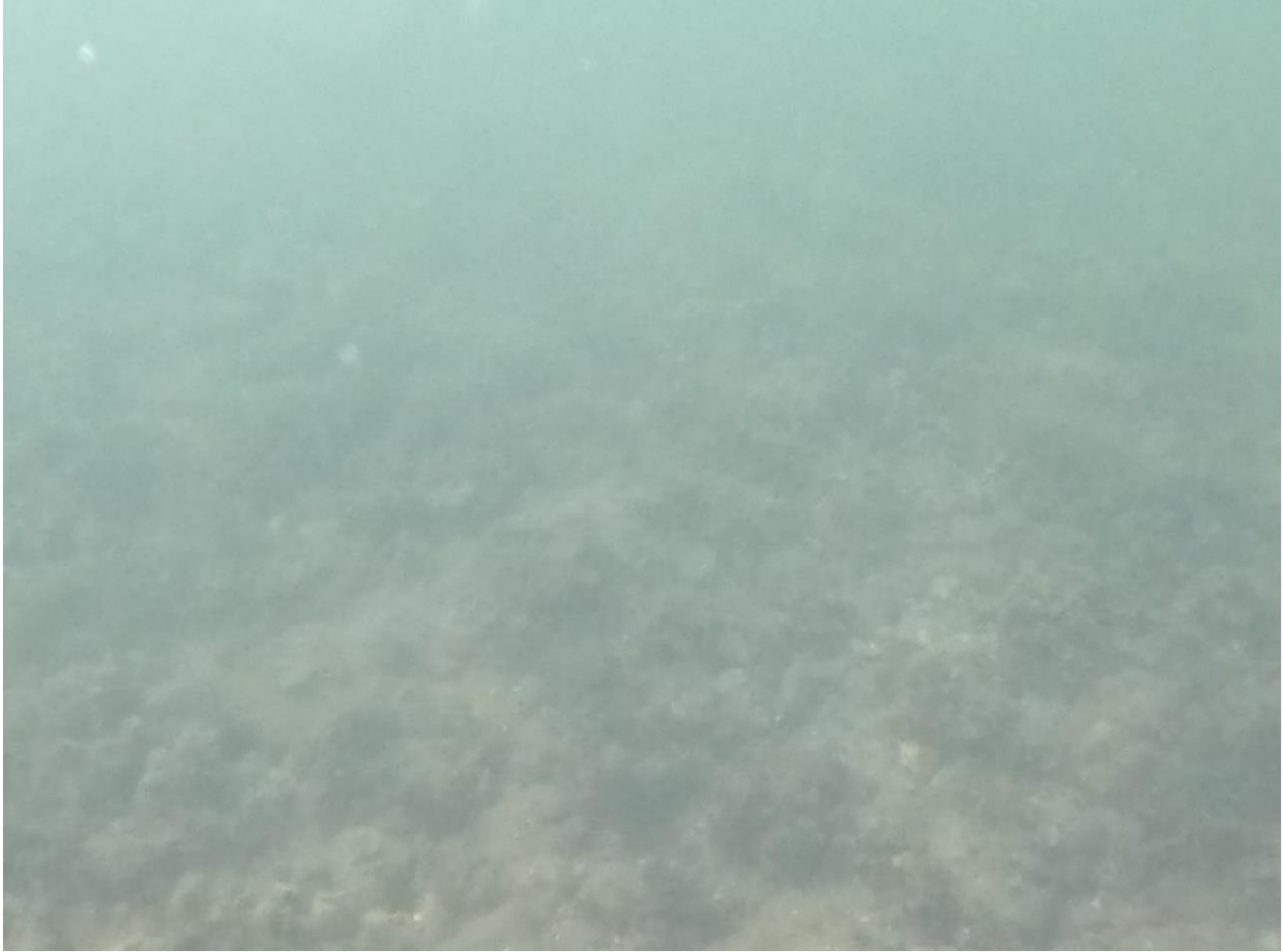
Plate 3 Rubble, silt, sand and macroalgae in the proposed harbour dredge area