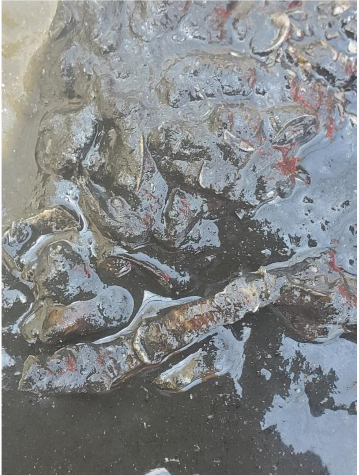
Plate 5 Grab sample from the dredge basin; Shells and worm tubings in a silty, sticky sediment