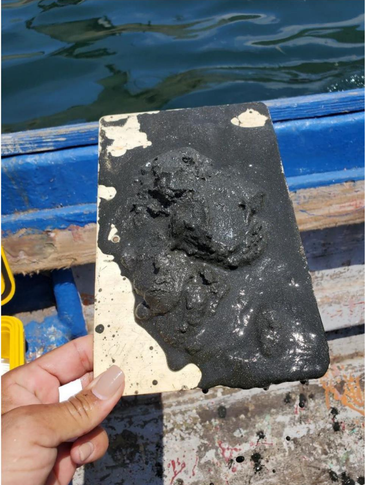
Plate 4 Sediment sample at western side of the harbour dredge area