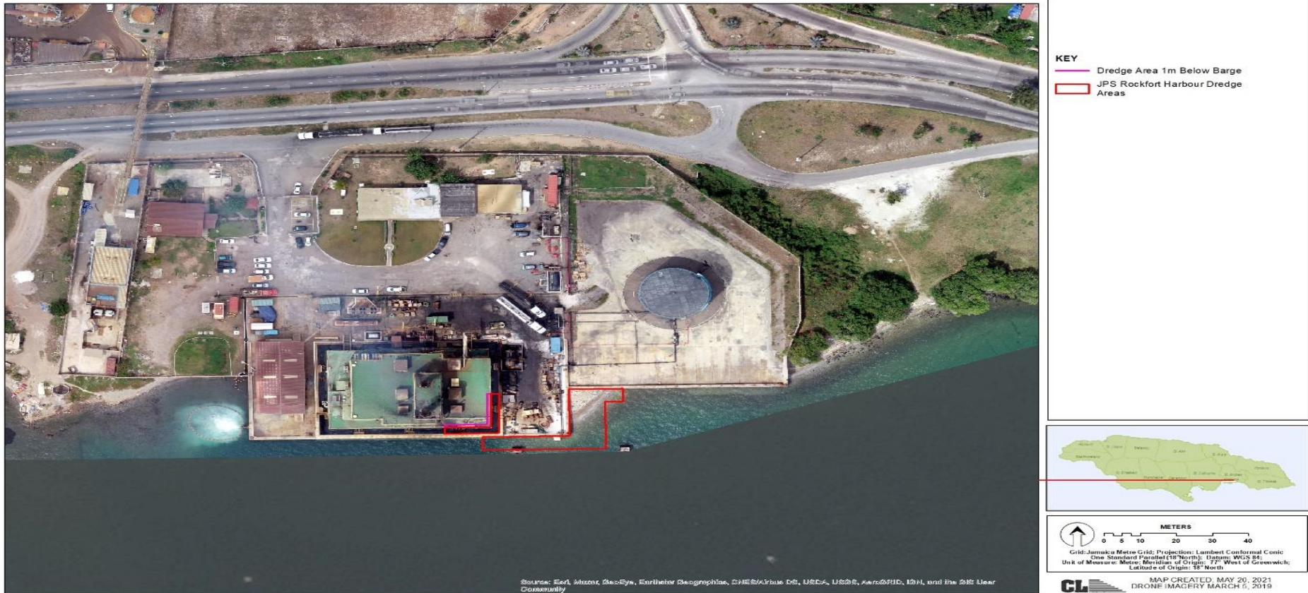
Figure 2 Areas to be dredged