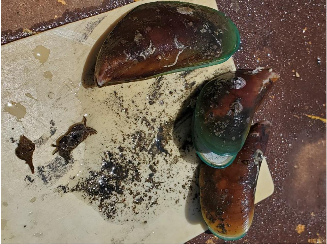
Plate 6 Perna viridis, crabs and shells from with the dredge basin