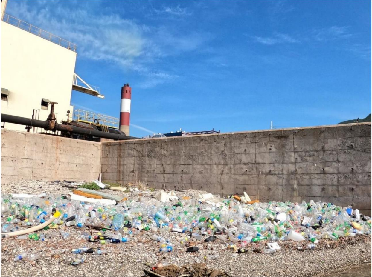
Plate 1 Beach area with the proposed harbour dredge area, littered with plastic bottles and marine debris