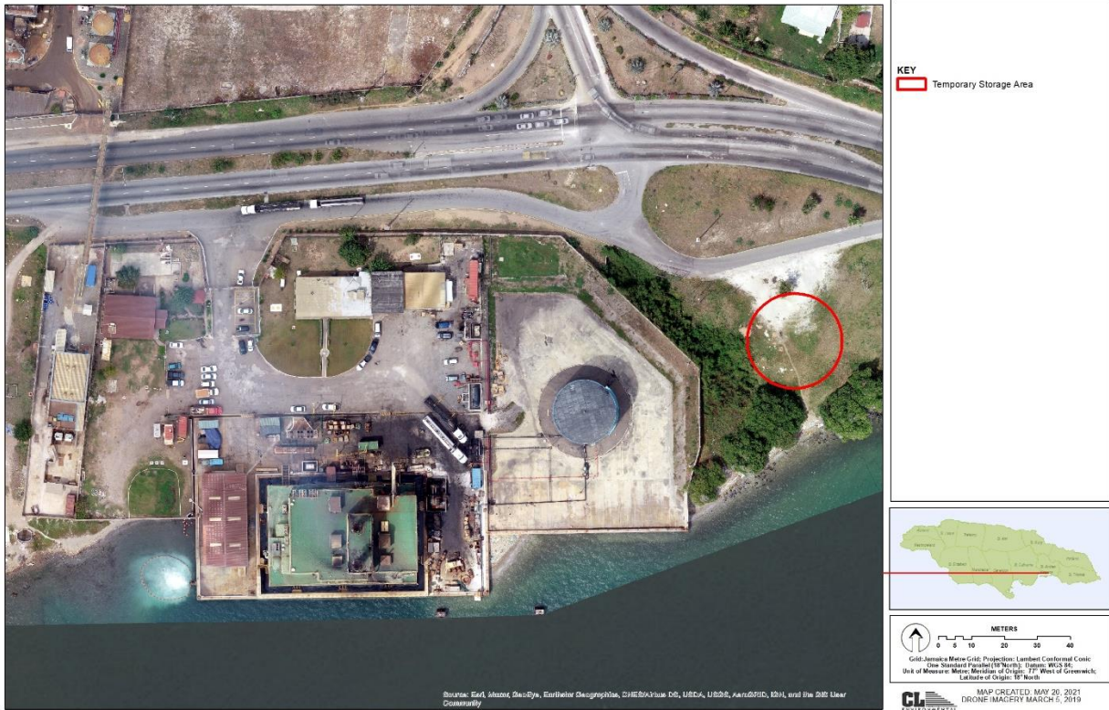
Figure 4 Locations of temporary storage of dredge spoils