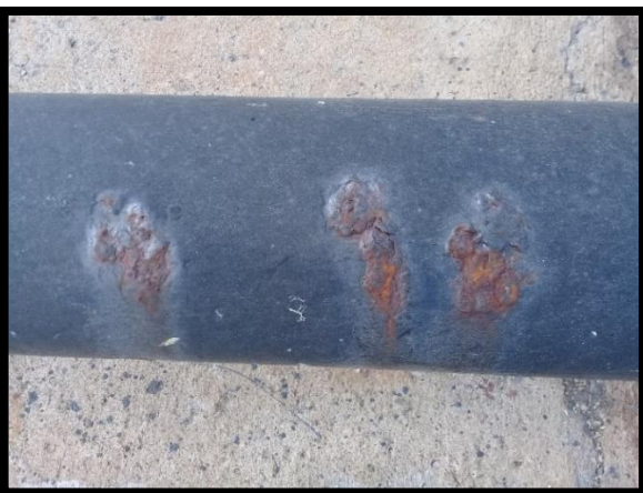
8" Inlet Pipe Corrosion