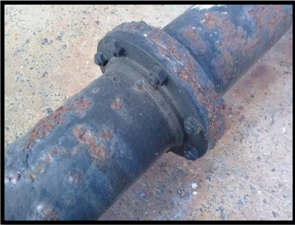
8" Inlet Pipe Corrosion