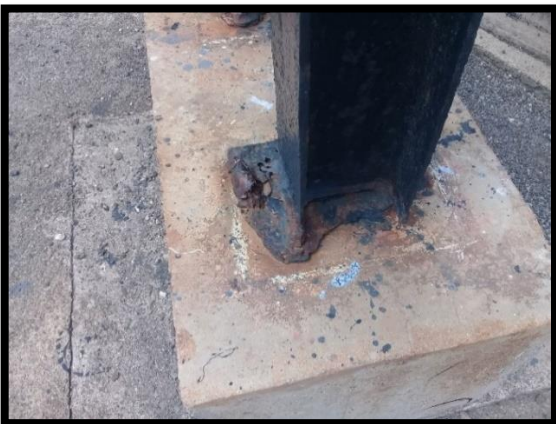
8" Pipe Supports