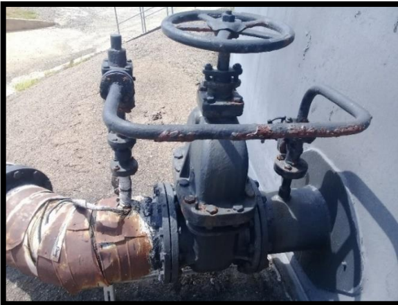
Tank Inlet Corrosion