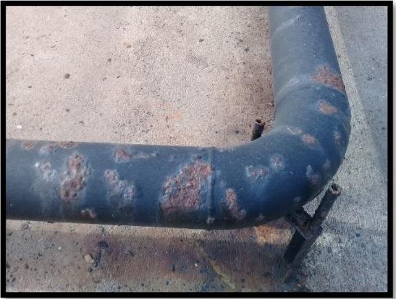
8" Inlet Pipe Corrosion