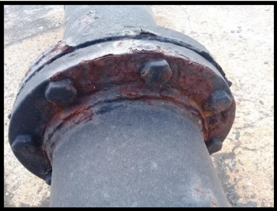
6" Inlet Pipe Corrosion