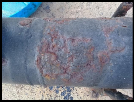
8" Inlet Pipe Corrosion