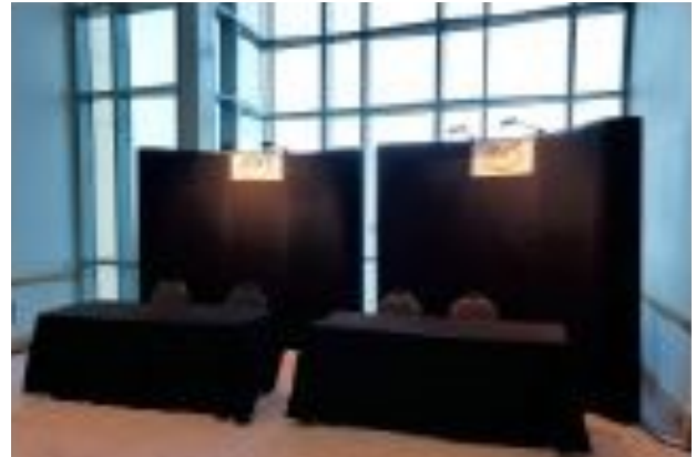
Example of a Curved Booth Set up

As such we will need to have the necessary documents to do so: