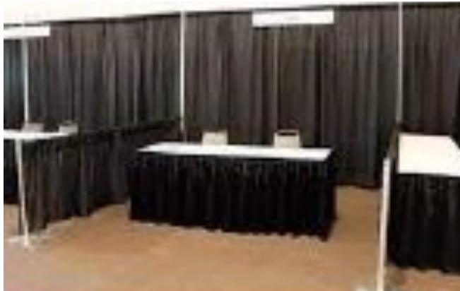
Example of a Pipe and Drape Booth Set up